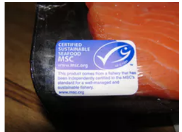
Look for MSC certification that is sustainable and eco-friendly.

Read more: Here's why your sustainable tuna is also unsustainable