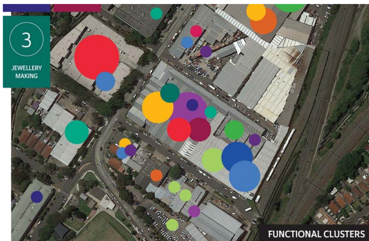
Functional clusters in Carrington Road, Marrickville. Made in Marrickville report, 2017

What underpins this pre-eminent creative-manufacturing interface precinct? It's a combination of affordability, sympathetic landlords, industrial land use zoning, and a mix of small and large factory spaces with suitable features.