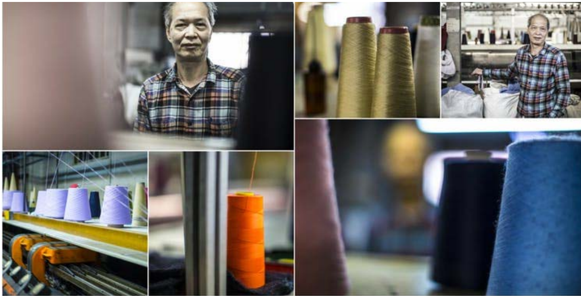
Kings Knitwear, on Carrington Road, is Sydney's last woollen knitwear factory and supplies local makers and designers as well as national fashion brands.

Creative micro-enterprises and small manufacturers reported that city fringe relocation is not feasible. Rezoning this industrial space, one of inner Sydney's last, may force enterprises to close altogether. Others said they would move overseas.