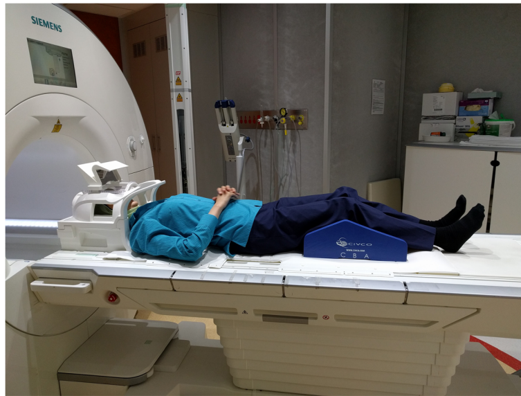
Fig. 2 Research scan patient setup for MRI in MPHNC study

physician's report. Local control for patients will be assessed at 12 months as indicated by having no evidence of local disease on clinical (including endoscopic) examinations and imaging studies at 12 months. Tumour response will be assessed using Response Evaluation Criteria In Solid Tumors (RECIST) criteria version 1.1[39] which is the internationally recognised gold standard assessment method on the evaluation of therapeutic response in solid tumours.