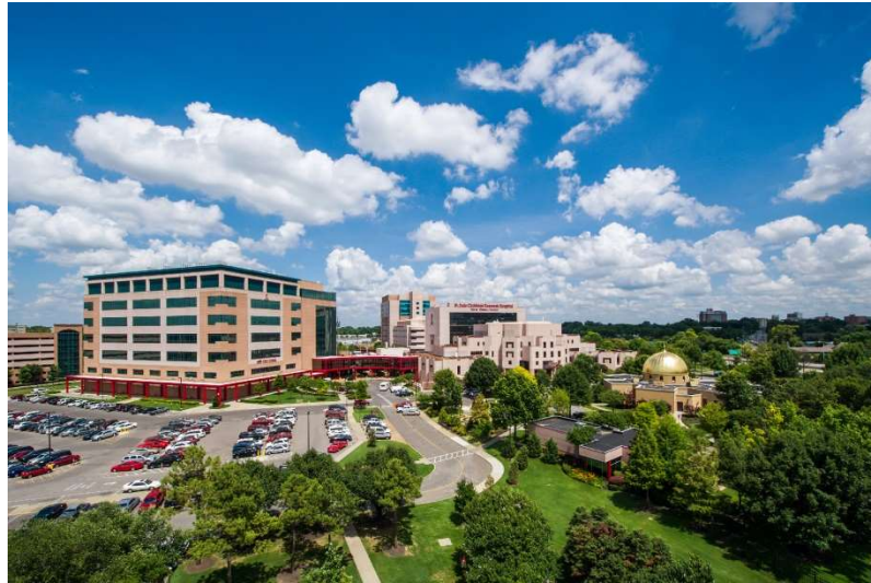
Exhibit 2 Photograph of St. Jude Children's Research Hospital