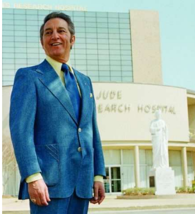
Exhibit 1 Photograph of Founder, Danny Thomas