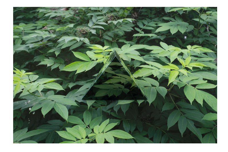
Esther Nooner, Geometric Landscape I, Archival Inkjet Print 2017