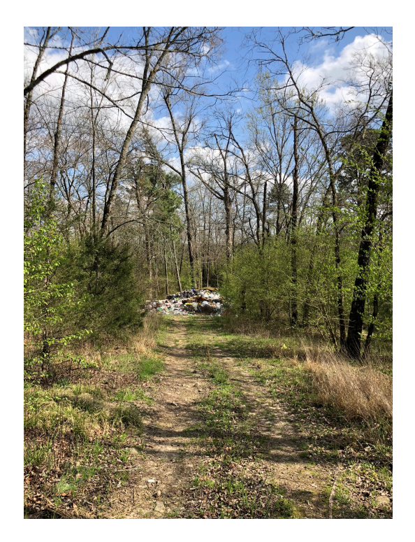
Human Formed Mountain, Courtesy of the Artist, 2018