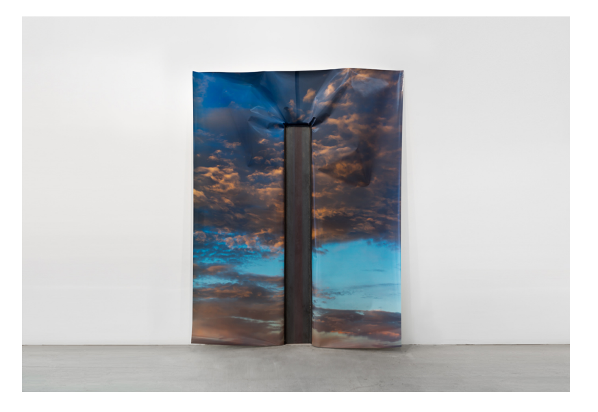
Letha Wilson, Steel I-Beam Wall Push, Digital C-print, steel, 2018