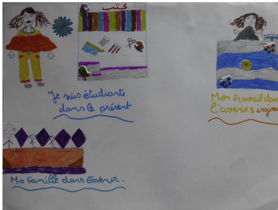
Fig. 3. Integrating work and family (Drawing by Girl27, EfA1).

at home and pray, not go outside [...]. It's not possible [...] not acceptable" (Aida). Mustafa further argued, "Everyone says the girl is a weak person, she has a weak personality [...]. Berber people don't want women to contact with other people." Women's seclusion and restricted mobility is justified by sociocultural practices and religious beliefs that partly rest on essentialized gender attributes. "Boys can fight for themselves [...] they are not like the girls, who are weak" (Rachida). The internalization of these gender discourses affects women's perception of legitimate behavior, which