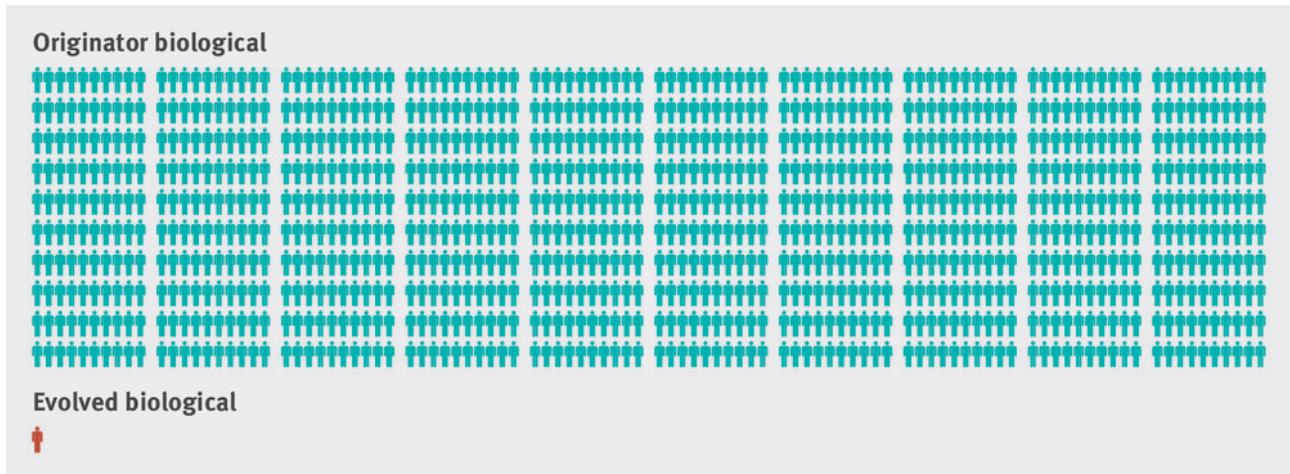
Fig 3 The potential for dilution of safety signals from evolved biologicals. Exposure of an evolved biological can be dwarfed by the patient exposure of the original product. One person represents 500 patient years.