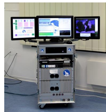
Fig. 5. Remote unit to control the ground station from DLR Bremen (left screen: RF configuration; center screen: user/satellite operator applications; right screen: graphical representation of satellite orbit)