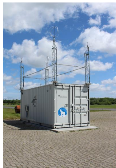
Fig. 1. Satellite ground station placed in a sea container [1] with different antennas on an airport close to the city of Wilhelmshaven (GER)

The L.A.R.S. ground station offers operations, service and maintenance from a single source.