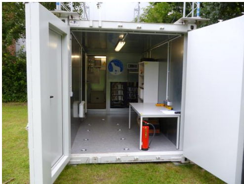
Fig. 2. DLR RF container interior view

lation against low outside temperatures. Furthermore the container is divided into two rooms. The first one is the technical compartment with the complete computer- and RF setup, the second one offers space for storage, service and stowing for transport (see Fig. 2). All antennas for the different applications are mounted on the top.