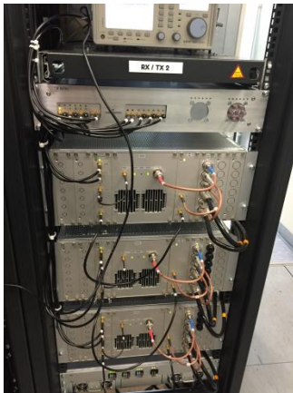
Fig. 7. RF setup with switching matrix, power supply and RF racks

The transceiver system is redundant as well, that means two SDR transceivers, with high quality frequency transverters [5] and low noise amplifiers manage the frequency conversion towards IF (and vice versa) and guarantee the optimum signal levels. The maximum uplink power is approximately 100 W for all bands. Real tests with different cube satellites showed good results. The complete RF system is remote controlled and also monitored, so that one can keep track of all relevant parameters like system voltages, currents and temperatures of the system-critical modules like amplifiers.