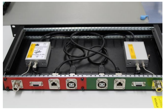
Fig. 8. ADS-B rackmount unit

Fig. 8 shows the redundant ADS-B rack unit, made of two independent receivers by Jäger EDV [8].