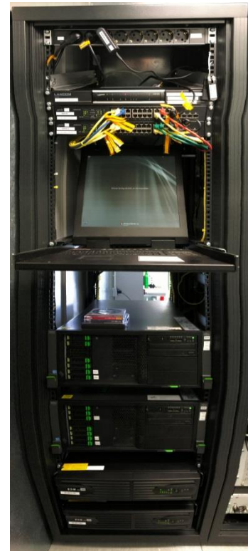
Fig. 4. Redundant computer system

system to allow control and the manipulation of all settings and to provide data exchange for RX/TX. The ground station itself can be remotely accessed via a secure VPN connection. Fig. 4 shows a full view of the server rack, in Fig. 5 the remote control unit at DLR Bremen is shown.