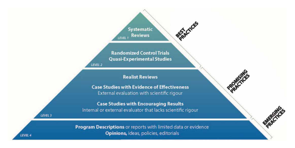
Figure 2 | Hierarchy of evidence (Canadian Homelessness Research Network 2013).