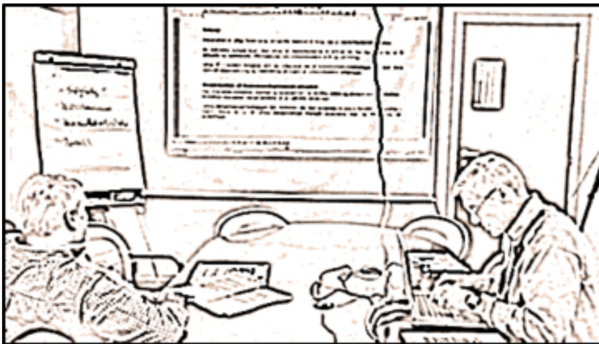
Figure 1 - The meeting setting