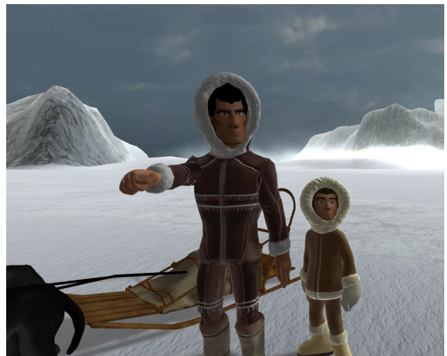
Figure 1: Example Scene from the visualisation of the story “The day Tuk became a hunter”. Here Tuk is shown in the Arctic with his father, making preparations to go seal hunting together.

Copyright © 2017, International Foundation for Autonomous Agents and Multiagent Systems (www.ifaamas.org). All rights reserved.