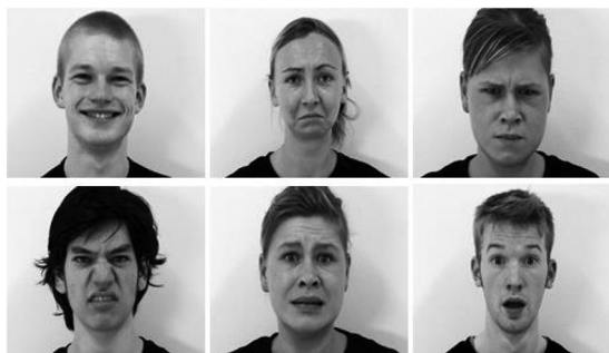
Figure 1. Real human face stimuli displaying prototypical emotions (from top left to right) happiness, sadness, anger, disgust, fear and surprise. Source: Van der Schalk, Hawk, Fischer, Doosje.

Participants were tested individually and seated in front of a computer screen. They were asked to categorise the emotions presented as happiness, sadness, anger, disgust, fear or surprise. In order to ensure that participants understood the test instructions, three training trials with feedback preceded the test trials. The test consisted of two blocks (one static and one dynamic) each containing 30 trials, showing five of each of the six emotions. The order in which the trials were presented was randomised across the children and the order of presentation (static or dynamic) was counterbalanced. Each stimulus was presented on the screen one at a time in a random order. The videos lasted for five seconds