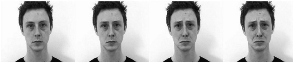
Figure 2. Static screenshots of the apex of the dynamic clips showing sadness at four levels of increasing intensity (from left to right, 0%, 25%, 75% and 100%).