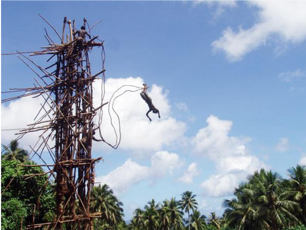
Plate 1: The Gol Ritual