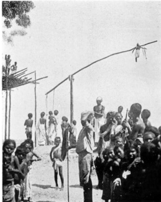
Plate 3: Hook swinging, India