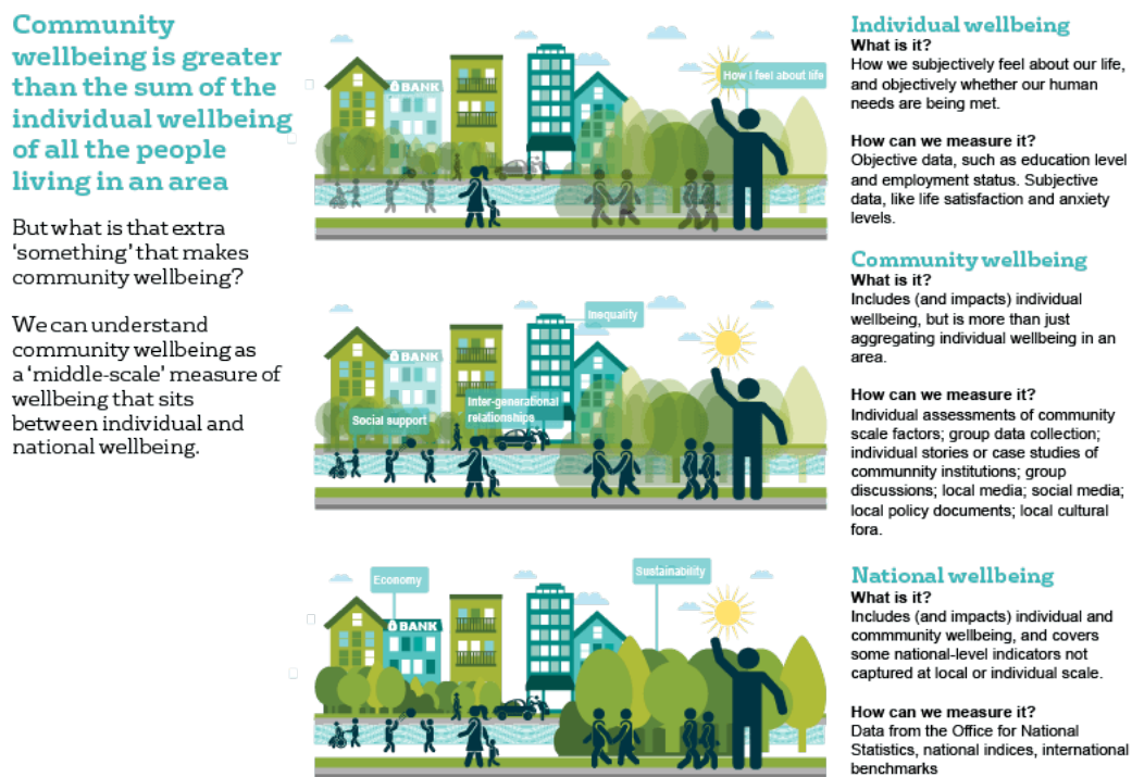
Figure 1: Concept of community wellbeing (from Atkinson et al. 2017)

https://www.whatworkswellbeing.org/blog/what-is-community-wellbeing- wellbeing/?mc_cid=53cf82ad99&mc_eid=fa077fdc1f )