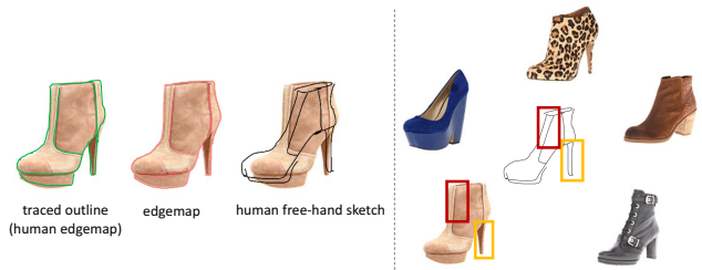
Figure 1. FG-SBIR is challenging due to the misalignment of the domains (left) and subtle local appearance differences between a true match photo and a visually similar incorrect match (right).

With the proliferation of touch-screen devices, a number of sketch-based computer vision problems have attracted increasing attention, including sketch recognition [47, 36, 3, 32], sketch-based image retrieval [46, 24, 10], sketch-based 3D model retrieval [39], and forensic sketch analysis [14, 28]. Among them, using a sketch to retrieve a specific object instance, or fine-grained sketch-based image retrieval (FG-SBIR) [15, 46, 31] is of particular interest due to its potential in commercial applications such as searching online product catalogues for shoes, furniture, and hand-