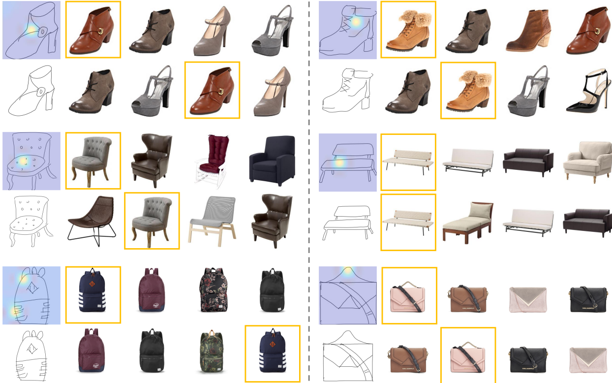
Figure 5. Comparison of the retrieval results of our model and Triplet SN [46]. For each example, the top row is our retrieval result with attention mask superimposed on the query sketch, and the bottom row is retrieval result of the same sketch using Triplet SN.

shown in Table 5. It can be seen that: (1) The proposed 2nd order outer subtraction based HOLEF loss is the best. (2) Even with learnable weights, both weighted Euclidean and Mahalanobis distance in most cases cannot beat the conventional triplet loss with Euclidean distance. (3) Even with a 2nd order energy function, the bilinear product of element-wise subtraction used in Mahalanobis distance is ineffective at dealing with the noise and feature misalignment of the two domains.