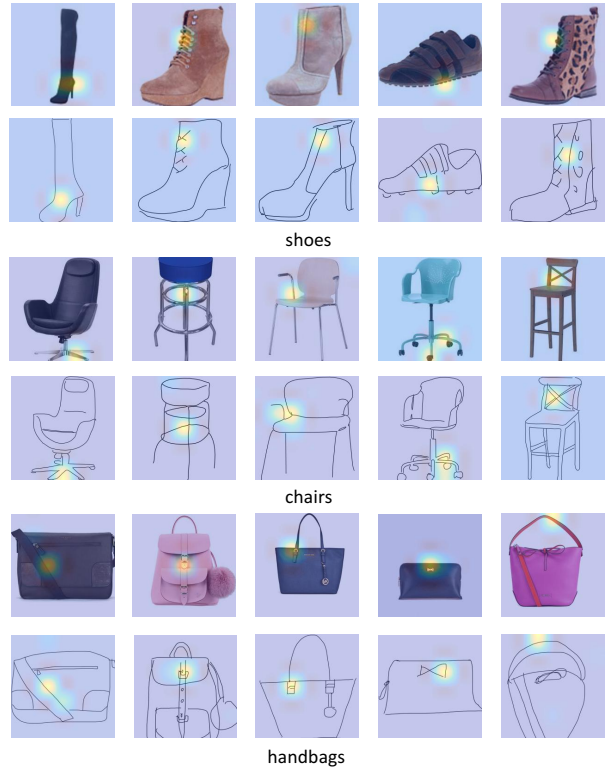
Figure 4. Visualisation of attention masks of sample photo-sketch pairs in all three categories.

validate the effectiveness of our HOLEF loss, we compare with: (i) conventional triplet loss with Euclidean distance, (ii) triplet loss with weighted Euclidean distance, and (iii) triplet loss with Mahalanobis distance. The first two are first order whilst the third is second order. The last two have learnable weights while the first does not. All models have the same base network and attention model as well as CFF. They thus differ only in the loss used. The results are