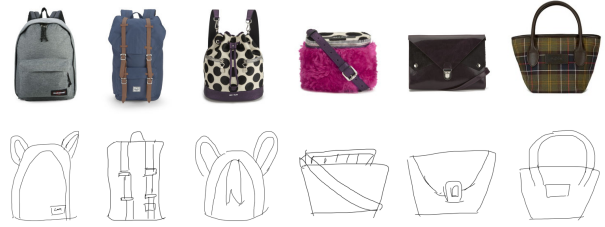
Figure 3. Examples of newly collected Handbag dataset.

where \mathbf{M} is a learnable matrix. Compare Mahalanobis distance to the proposed distance in Eq. 6, it is clear that although both are 2nd order, there is a vital difference: In Mahalanobis distance, one first computes the element-wise subtraction \mathbf{x} - \mathbf{y} and then the 2nd order bilinear product of the difference vectors. In other words, elements of different positions in the two vectors are not directly compared. It is thus not suitable for dealing with fine-grained feature misalignment and using correlation to compensate for noise in the sketch and photo feature vectors.