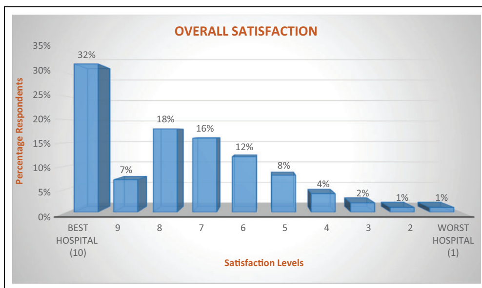
Figure 1. Overall satisfaction distribution.