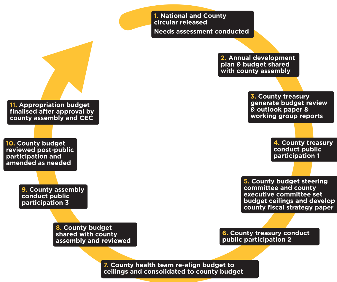
Figure 2. County level annual planning and budgeting cycle

planning as well as developing the 5-year county integrated development plan (CIDP) and the 5-year county strategic plan for health. These plans should align with national health policy and strategic planning documents, including community health strategy guidance (Ministry of Health [Kenya] 2014b). County level also hold responsibility for health service delivery for level one to three services (community, primary and county referral services), recruitment and management of health workers and coordination of partners. Within the county, a number of actors are engaged in the priority-setting process for the annual budget and planning cycle (see Figure 2 ).