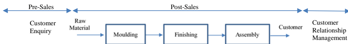
Figure 1: Simplified Production Process in Company A

This company is a rotational-moulding plastic product manufacturer who has been in the industry for over forty years. There is no dedicated production line, resources are heavily shared and the production process is labour intensive. The simplified process diagram is as shown in Figure 1 below. Although the company uses Sage with a bespoke manufacturing module, the function of the manufacturing module was restricted to generating paper job tickets to the shop floor. There were no digital means of communication between shop floor and the other departments except by physically visiting the premise. Production is only started upon receipt of firm orders and the plastic products produced are based on a standard range of product design offered, known as the 'base unit'. Based on the selected base unit, customers are offered a range of sixteen colours. In addition, customers are able to customise their moulds using mould-in-graphics. The customised features and acceptance of small order quantities provides a unique service in the market. Some of the issues faced by the company are discussed in Table 1 below. The remainder of this section will begin by analysing the role of the production manager, using the three roles discussed in literature review. This is followed by a demonstration of how PPC is developed according to the four design aspects identified in previous section.