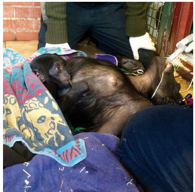
Figure 2. Positioning of an adult female bonobo and her infant during the investigation of a skin mass.

3.5 mg atipamezole (0.1 mg/kg, Antisedan®, 5 mg/ml, Vetoquinol, United Kingdom) was administered in the right biceps muscle giving a total anaesthesia time of 103 minutes. Prior to full recovery of the dam, the infant was weighed, a hair sample was taken for genetic testing and a microchip (Trovan®, Germany) was