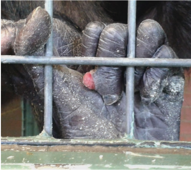
Figure 1. Digital mass on the third digit of the left foot of an adult female bonobo ( Pan paniscus ). Note the ulcerated fleshy polypoid lesion, prone to haemorrhage, and the basal rim of epidermal hyperplasia and hyperkeratosis.

procedure with minimal intervention planned. The procedure was also limited to minimal essential staff and additional procedures, e.g. cardiac and abdominal ultrasonographies were excluded from the procedure to limit anaesthetic time.