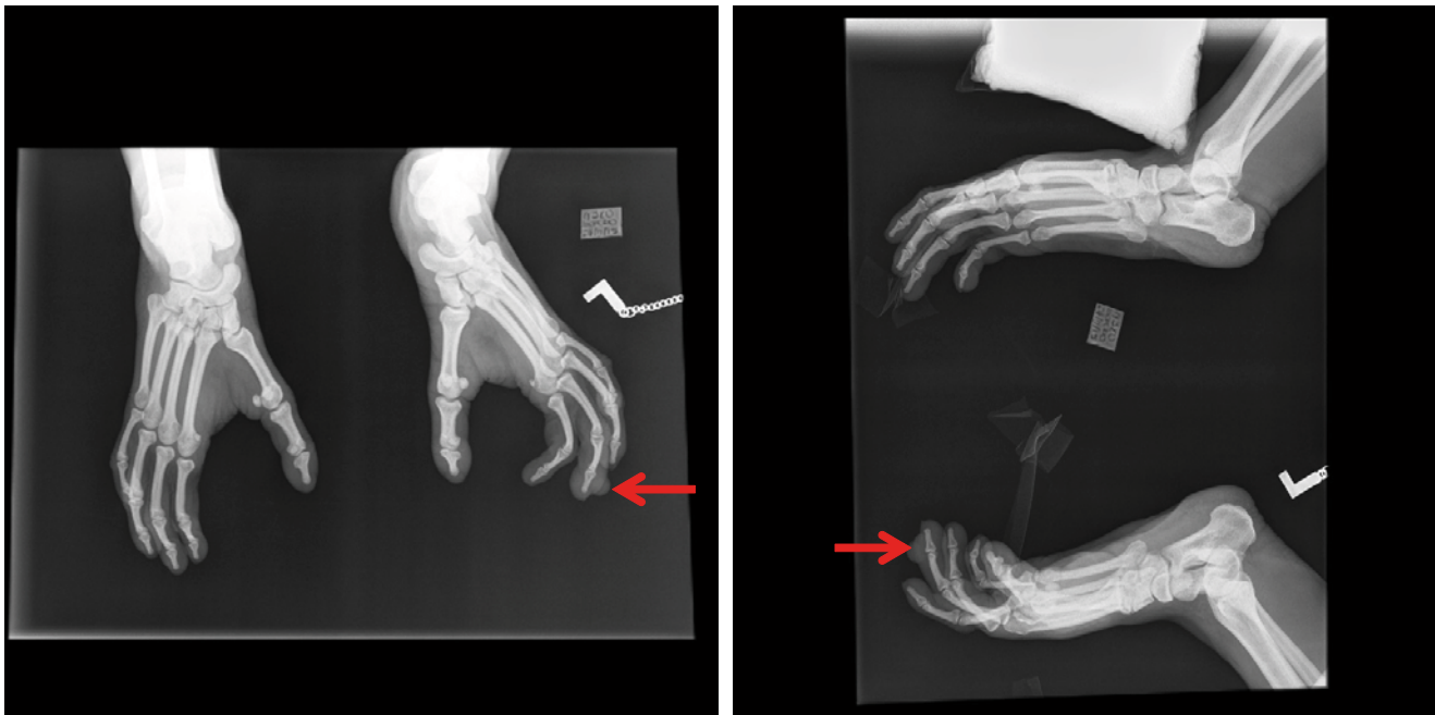
Figure 3. Radiographs of feet of an adult female bonobo taken during the investigation of a skin mass (red arrows).

placed between the scapulae. The adult female was extubated eight minutes after reversal of anaesthesia. Recovery was normal with no anaesthetic complications.