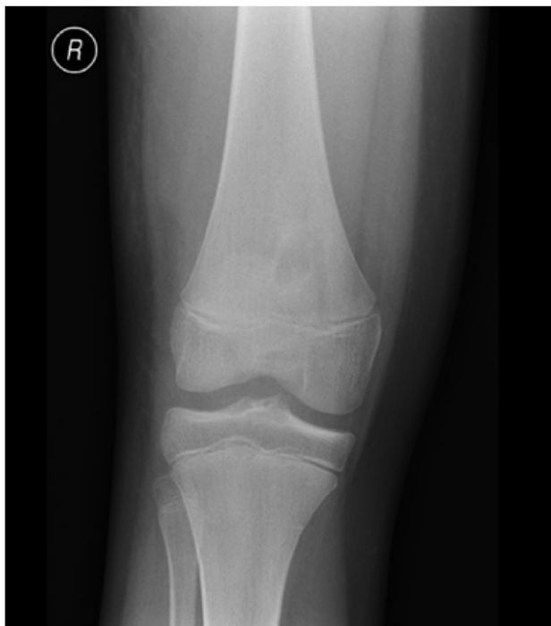
Figure 1: Radiograph on presentation to A + E. The radiograph displays 'a well corticated lesion (15 mm × 17 mm) in the distal femur'.