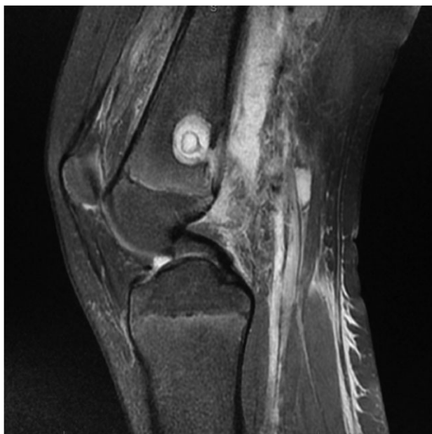
Figure 2: MRI Images on admission to Hospital. MRI images displaying 'osteomyelitis with sequestration and erosion through the posterior cortex, extensively extending into the surrounding soft tissues'.

'A large complex loculated abscess, 10 cm × 8 × 8 cm, extending between the muscles and extended to the posterolateral aspect of the distal femur. A cloaca is present in the cortical bone on the posterior aspect of the distal femur.'