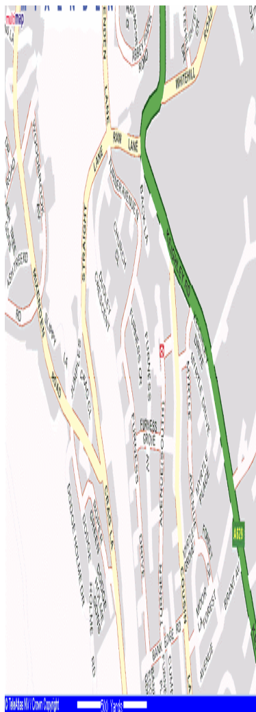
Figure 1: Mapping activity guidance

photographs of places where they hang out and have fun, people they respect, places they would like to visit and places that are considered off limits locally. In other contexts we used large, colourful Ordnance Survey maps to talk with participants and staff about familiar places to help young people locate themselves. For those who did not wish to engage in discussion, and indeed for those who did, young people were encouraged to stick coloured post-its to the map, the colours representing ideas such as 'a place which is off limits' or 'a place where I play.' These approaches were embraced with great enthusiasm by some, though not all, participants who chatted with the researchers about what they intended to take pictures of and why those places and people mean so much to them. This kind of map work is valuable because of the impact of space on the social relations of young people. Space is deeply embedded within notions of local knowledge, which contributes to the ways in which localities are subjectively inhabited, with risk, danger and safety being part of the calculation young people use to negotiate it.