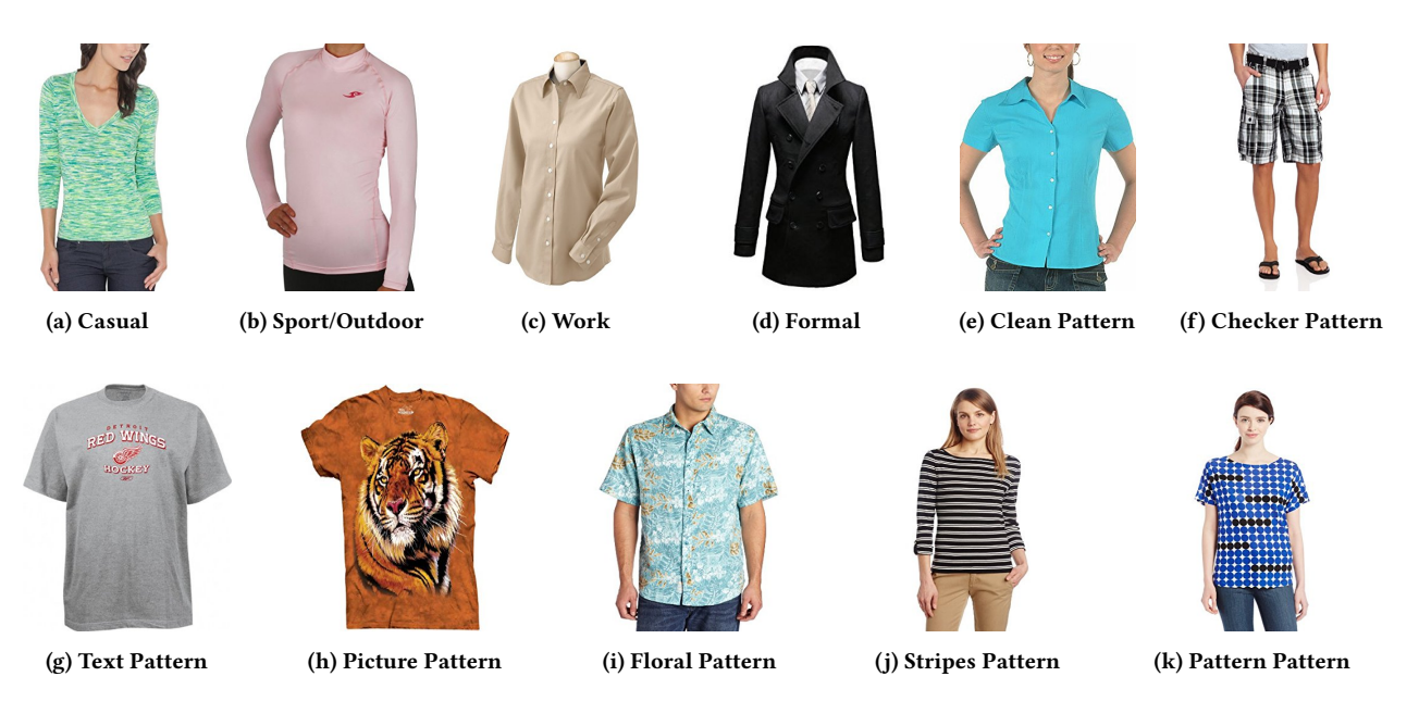
Figure 1: Example of Images with Different Formality and Pattern Attributes

color (cl^{i^t}) , top pattern (pt^{i^t}) , top formality (fm^{i^t}) , bottom color (cl^{i^b}) , bottom pattern (pt^{i^b}) and bottom formality (fm^{i^b}) .