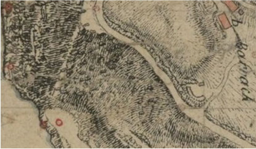
In this detail from the Royal Engineer's plan of 1818, which is rotated ninety degrees clockwise, the probable route of the fisherman's path is plainly visible in the upper left-hand corner. The elongated v-shaped redan battery can be seen just above the Portage Road. Although the fisherman's path is shown running in a fairly straight line, it likely meandered down the cliff.