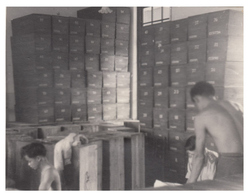
HK 47 Sorting coffins by serial number prior to reburial. Canadian mortuary; Lye Mun Bks. Hong Kong June 47. [DHH, 593.009 (D6), "C" Force Cemeteries – Hong Kong & Yokohama (2 Scrapbooks "Japan" & "Hong-Kong.")]

Work at the Sai Wan site recommenced with a third set of plans in January 1947. Construction was slow based on the lack of machinery available (one bulldozer) as well as a combination of inconsistent labour and inclement weather. As the site engineers continued to pass extensions for completion, Bailie approached the General Officer Commanding for personal help in prodding the project along. On 23 May 1946, the A/GoC toured the site and confirmed many of Bailie's complaints, including the collapse of an 80-foot section of a retaining wall. Following the site visit, the A/GoC committed to weekly site visits to hasten construction.<sup>43</sup> Complications continued as the site was excavated. In some areas blasting was required to open up burial spots as dense rock formations jutted up into the soil, and in other areas veins of decomposed granite caused instability.