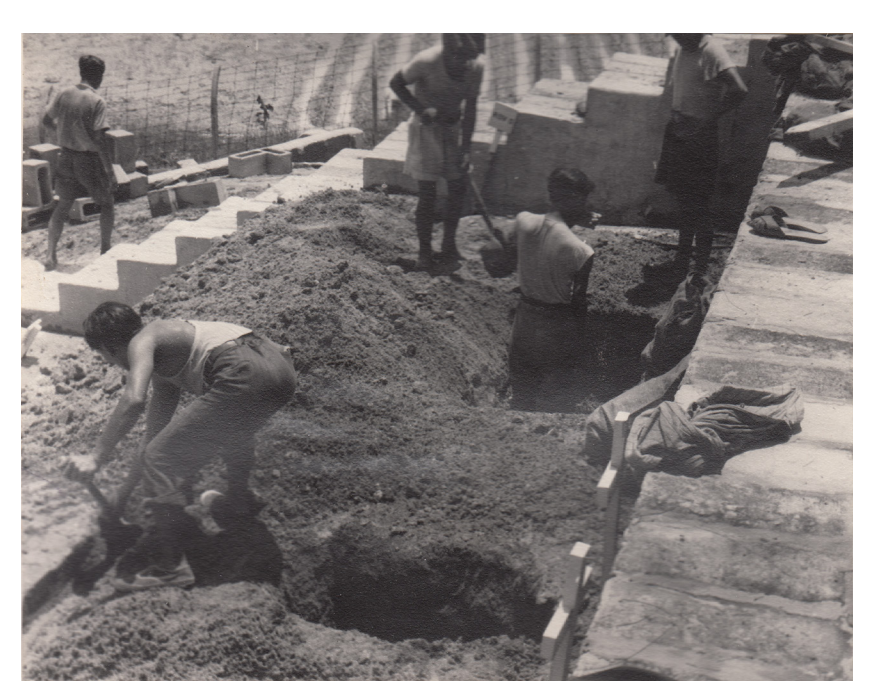
HK 45 Exhuming Canadian Remains from Stanley Military Cemetery for reburial in Sai Wan Military Cemetery, Canadian Section, Jun 1947.