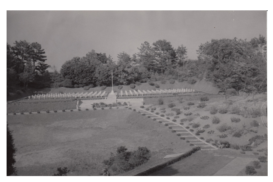
Canadian Section – British Commonwealth War Cemetery. Hodogaya, Yokohama Japan. [DHH, 593.009 (D6), "C" Force Cemeteries – Hong Kong & Yokohama (2 Scrapbooks "Japan" & "Hong-Kong.")]

volume of remains that were concentrated there. Ashes were placed in lacquered urns, indexed, and stored on shelves along the "Canadian Wall, Dutch Wall, Australian Wall' etc."<sup>20</sup> In Japan, Bailie's role was mainly focused on matching numbers on nominal rolls and making sure all of the remains were properly identified, marked, and indexed.