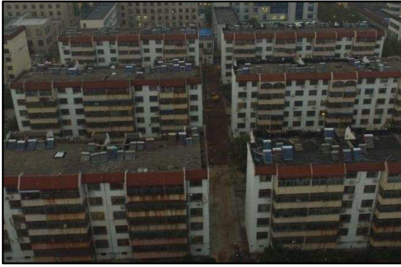
Fig. 5. Individually installed SWHs on the roof of residential buildings in Rizhao.

In 2004, seeking a solution for unregulated installation of SWHs, a government official in the Bureau of Housing and Urban-Rural Development of Ju County went to Himin's production base in Dezhou city, where he saw for the first time the building-integrated SWH installed in dormitory buildings (D11 -> D23). Inspired by Himin's own self-regulation, this official issued a proposal for integrating SWHs into the design and construction of residential buildings in Ju county, which was later documented in their regular conference summary as "the mandatory installation regulation of building-integrated SWH in newly-built residential buildings" (D23) (Interview, Real estate developer). Although an official regulation was not issued in Ju county, the mandatory installation of SWH was implemented quite strictly (Interview, Government), which helped the maintenance of SWH related socio-technical experimentation in Rizhao in terms of market expansion and legitimacy building (D23 -> D14 and D16).