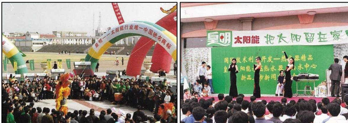
Fig. 3. Advertising activities organized by Himin in the 1990s.