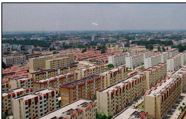
Fig. 4. A bird's eye view of the roof-mounted SWHs in Ju county, Rizhao.

In Rizhao, a promising market attracted new enterprises into the industry. Muyang, a local SWH manufacturer in Ju county in Rizhao, was founded in 2003 (D11). Following the experience of