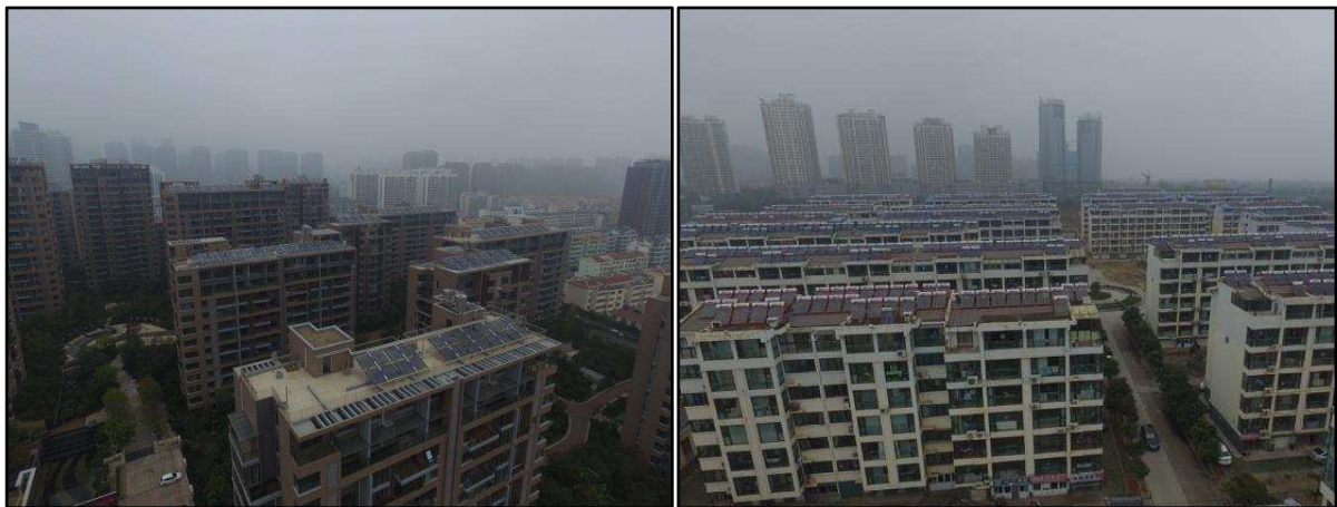
Fig. 6. The embeddedness of SWH in the urban landscape in Rizhao.

In the case of Rizhao, socio-spatial reconfigurations mainly manifest in the formation of industry clusters and the changes in urban infrastructures, consumption culture and social practices. In 2011, there were more than 150 SWH-related enterprises in Rizhao, providing more than 30,000 jobs 13 . In particular, in Ju county, many small SWH-related enterprises cluster around the production base of MUYANG (D32). The urban built environment is reconfigured around SWH popularization. Fig. 6 illustrates the embeddedness of SWH in the urban landscape in Rizhao (D33). Residents' daily practices are also reshaped around new energy technologies. For instance, the interviews revealed that in relatively under-developed areas in Rizhao, the possession of a SWH is regarded as a symbol of social status, and it is even listed as one of the "must-have items" for a marriage, just as color TV and washing machines 14 (D33) (Interview, End-user). This is a typical case of the reconfiguration process of residents' consumption culture and the embeddedness of solar energy into the local contexts.