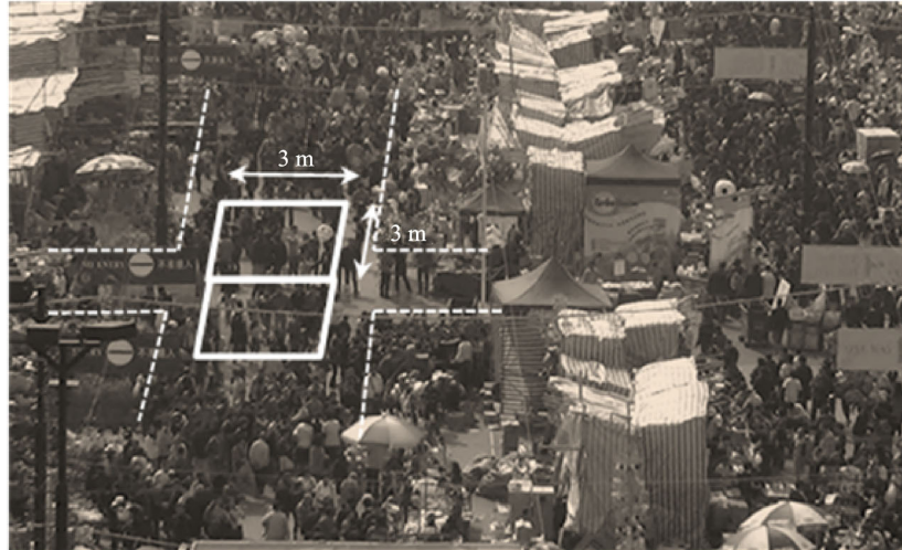
Fig. 1 Lunar New Year Market in Victoria Park

for a 2 s period were grouped, and the pedestrians within the ROI were manually tracked with a computer program (developed with Visual Basic 6.0). A few student research assistants were appointed to help with the pedestrian tracking.