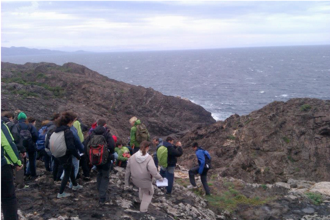
Fig. 4. Studying the relationships between pegmatites and the geological context in the Cap de Creus pegmatite field, in the fieldtrip held during the Pegmatite Workshop.

The UB reported the activities performed during this workshop in a video ( http://www.ub.edu/ubtv/ubtv_veurereg.cgi?G_CODI=02957&G_USCODI=97695&IDIO_MA=ALL&G_LLISTA=cerca ), and an explanation of the field work geology by some members of the Student Chapter was broadcasted by TV3 in the programme “El Medi Ambient”.