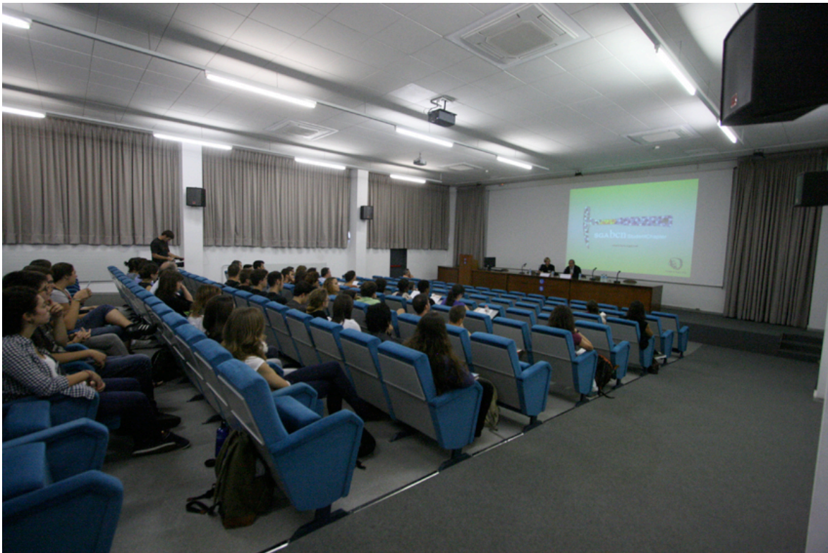
Fig. 3. Aspect of a session during the lectures by the international senior speakers whilst the Pegmatite Workshop.