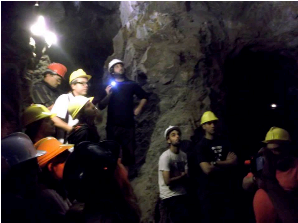
Fig. 7. Explanation of hydrothermal alterations inside the tunnels of the Eugenia mine in Bellmunt del Priorat, during the field trip to the Priorat domain.

also visited. Mines such as "La Serrana", a stratabound Mn mine, "Règia" mine and "Eugènia" mine (mainly mined for Pb until the 70s) and "Linda Mariquita" barite mine were visited. The visit to the underground work of the Eugènia mine was possible thanks to the collaboration with the Museu de les Mines de Bellmunt (Town Council of Bellmunt del Priorat; fig. 7).