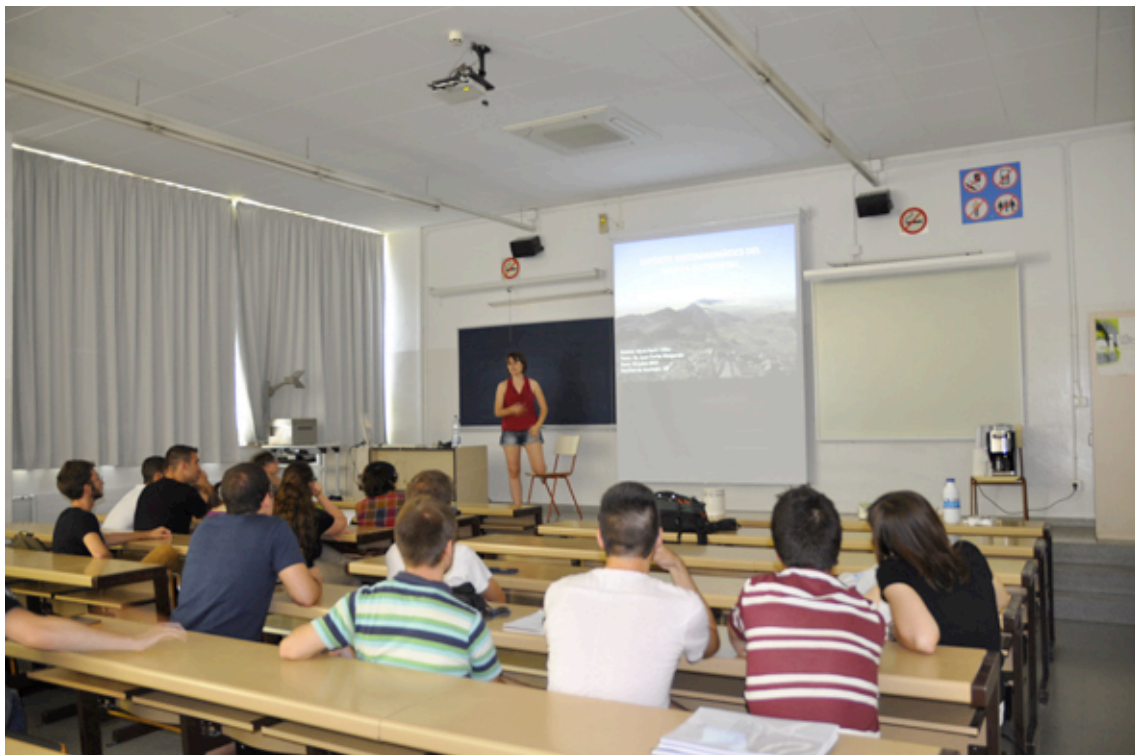
Fig. 10. A student discussing with the other students the results of her research.

In July 2013, the BCN-SGA SC organised a one-day meeting at the Faculty of Geology. This event consisted of four sessions of 10-minute talks in which most of the Student Chapter members explained their current research projects in English (fig. 10). Well received by professors and proved to be positive for the students, the activity was a success and will be repeated annually. Other activities arranged in order to stimulate the use of English among the students included the so-called Cineforum , which takes place once a month and enables the students to share ideas and discuss opinions in English after watching a movie.