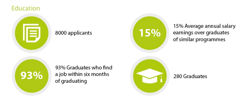
Figure 3. Some key figures of the KIC InnoEnergy Master School.

Some key figures of the Master School are given in Figure 3.