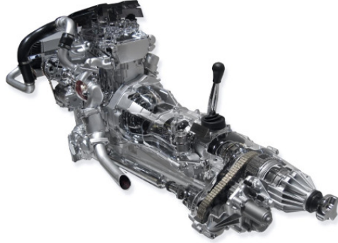
Fig. 1 Nissan Pathfinder engine, assembled in the industrial assembly line of the case study.

P_1, P_2, P_3 , are for 4x4 vehicles. Engines P_4 and P_5 are for vans; and the last four types ( P_6 - P_9 ) are for commercial trucks of medium tonnage.