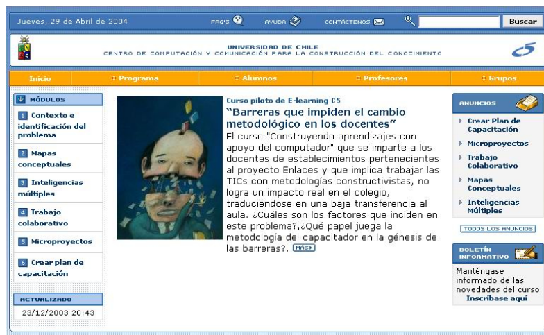
Figure 3. The main navigation screen of the e-Learning course

To illustrate the feasibility of the model we describe the implementation of a course on methodologies for using technology for teachers (see Figure 3). Thirty-five experienced teachers took the online course. We divided the course into eight working units with the corresponding learning activity and questions to enrich interaction among learners participating within the virtual dialog classroom. Each unit was covered in one week and ended with a synthesis of conversations, analysis, discussions, and exchanges.