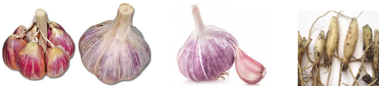
Figure 1 Pictures of garlic bulbs types (left – Czech type Bjetin ( Allium sativum ), middle – Polish type Harnaś ( Allium sativum ), and right – bear's garlic ( Allium ursinum ) (Garlik variety Harnaś, 2018; Registered varieties of winter garlic, 2018; Wild garlic ( Allium ursinum ), 2018).

Results of TAC were calculated from inactivation values using trolox as standard and expressed as trolox equivalents (TE) in \text{mg}\cdot 100\text{g}^{-1} sample. Average results were obtained from three parallel determinations.