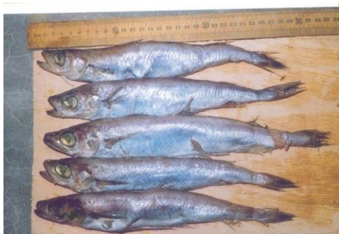
Fig. 1: Frozen Hake as displayed in the Market