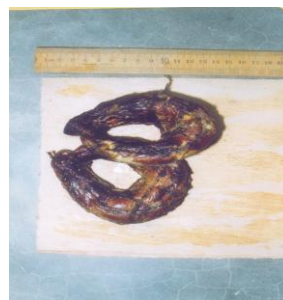
Fig. 2: Smoked Hake as displayed in the Market