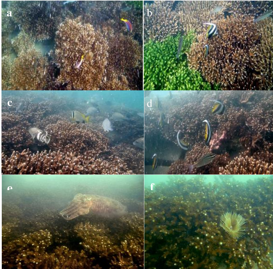
Fig 5. Residing fishes and other sea organisms on relocated coral colonies

To prepare the substrates, the side by side arrangement of concrete blocks can efficiently support coral reattachment substrates against strong waves and sea currents. Also, the holes of blocks provides habitat for fish and sea urchins which both are useful for survival of these corals (Bak, 1994).