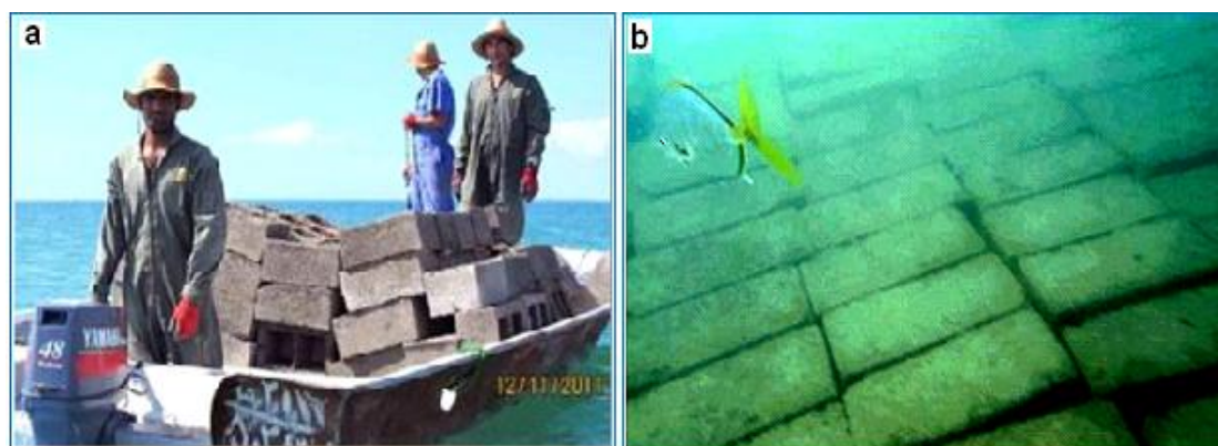
Figure 2: Designed concrete block (a), the arrangement of concrete blocks (b) for substrate preparation.

preparation of 37 substrates or receive sites (each site: 5m × 10 m) (Fig. 2).