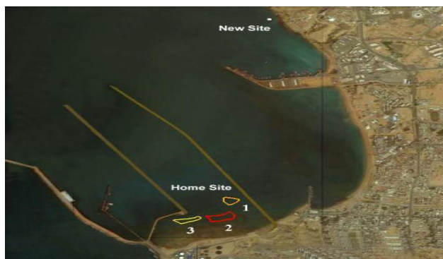
Figure 1: Location of Shahid Beheshti dock (Donor site) and Hotel Lipar (receive site) in relocation area of coral colonies.