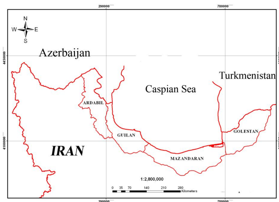
Figure 1: Sampling location in Caspian Sea

muscle samples (filleted and skinned) and liver tissue were dissected, washed in deionized water, weighed, packed in polyethylene bags and stored at -20\text{ }^{\circ}\text{C} for further analyses.