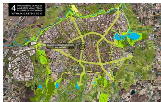
Figure 1.- Visual example of Green Urban Mesh.