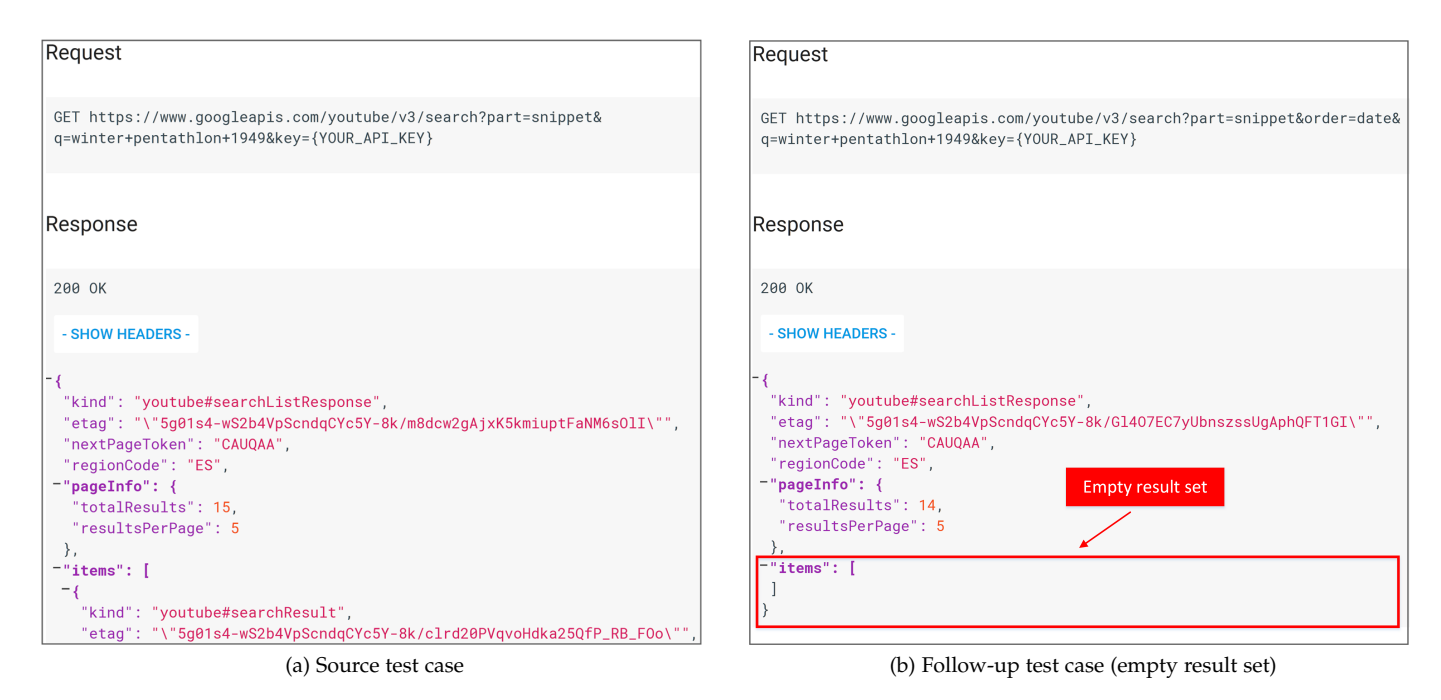
Figure 4: Metamorphic test revealing a bug in Youtube

in the source test case were not found in the follow-up test case, where the search was restricted to short videos only. This behaviour was observed in filter parameters such as locationRadius, channelType, videoEmbeddable, videoDuration and videoType, among others. We reported an issue for each parameter reproducing the problem (see supplemental material [31]). In October 2016, some of these issues were labelled as duplicated by YouTube developers and linked to another issue<sup>7</sup> reporting several acknowledged search-related bugs including, as described by YouTube developers, "incomplete results - results (under the 500 results maximum) that should have been returned but were not".