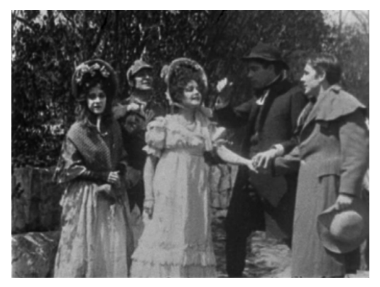
Figure 5. Outside locations in The Cricket on the Hearth.