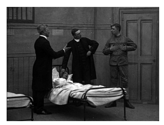
Figure 2. A prisoner's confession reveals the convict's innocence.

While in Great Expectations Magwitch is captured —although he escapes again later—, in The Boy and the Convict he escapes from the very beginning. This decision accelerates the time of the story and drives out other events present in the novel. Whereas he is also arrested by the end of the film, a major turning point takes place: a prisoner's confession reveals Magwitch's innocence. He is finally released and allowed to go back home (Aylott, 1909: [10:07-11:08]).