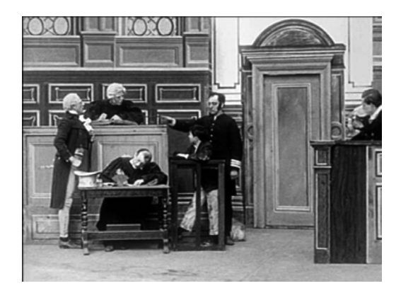
Figura 6. Large distance between camera and actors, and painted backdrops in Oliver Twist .

Whether modern techniques of editing, camerawork, acting and lighting are properly combined in The Cricket on the Hearth , the same cannot be said about Oliver Twist . The film presents nineteen self-contained scenes, most of them introduced by an explanatory title. Like in The Boy and the Convict , the camera remains static. The large distance between the camera and the stage impedes the audience from perceiving the actors' facial expression, but an attempt to convey a more natural acting is done. Here again, the film uses painted theatrical-style backdrops for interior scenes, with some real furniture mixed in.