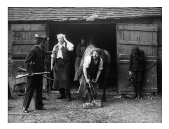
Figure 1. Opening of The Boy and the Convict . Two officers ask for the blacksmith's help.

The inciting incident of both the novel and the film is the convict's escape. However, Great Expectations opens with the powerful image of the tombstone of Pip's parents, in the churchyard at the marshes. There, Magwitch threatens him with death if he does not bring him some food and a file. No more information about the convict is provided until he is captured and the officers request Mr. Gargery's aid. On the contrary, the film opens with two officers asking for the blacksmith's help (Aylott, 1909: [00:14-00:26]).