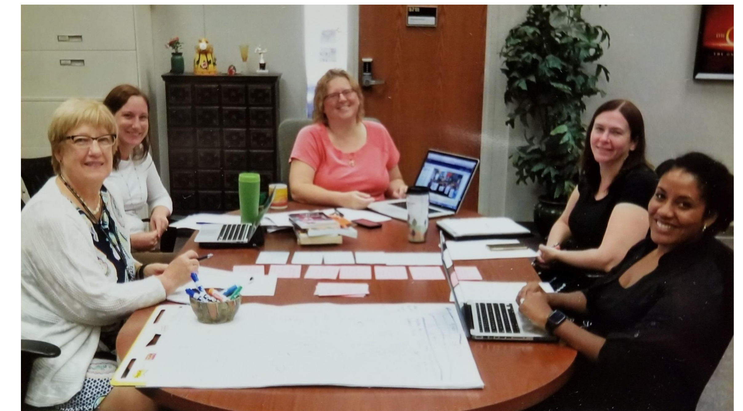
Extended Diversity 2016-17 Faculty, Librarians, and Instructional Designers working together