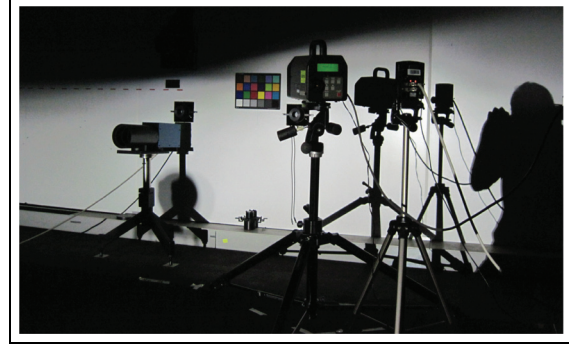
Figure 3. Real measurement conditions for the Macbeth ColorChecker chart white patch.

To avoid color modification of the entire scene, we applied a fragment shader only to the three-dimensional headlight projection. This fragment shader modifies the color using the von Kries chromatic adaptation model (see Equation (3)), where full adaptation by the observer is assumed. The CAT matrices used in this work are listed in Table 1.