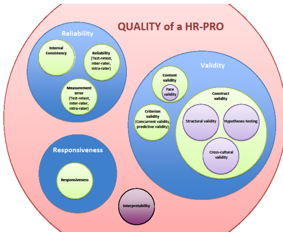
Fig. 2. COSMIN taxonomy of relationships of measurement properties. Abbreviations: COSMIN, Consensus-based Standards for the selection of health Measurement Instruments; HR-PRO, health related-patient reported outcome. Reprinted from Journal of Clinical Epidemiology. Vol. 63, no. 7, Mokkink LB, et al. The COSMIN study reached international consensus on taxonomy, terminology, and definitions of measurement properties for health-related patient-reported outcomes, Pages 737-45, Copyright 2010, with permission from Elsevier.