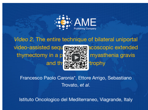
Figure 4 The entire technique of bilateral uniportal video-assisted sequential thoracoscopic extended thymectomy in a patient with myasthenia gravis and thymic hypertrophy (23).

Available online: http://www.asvide.com/articles/1510