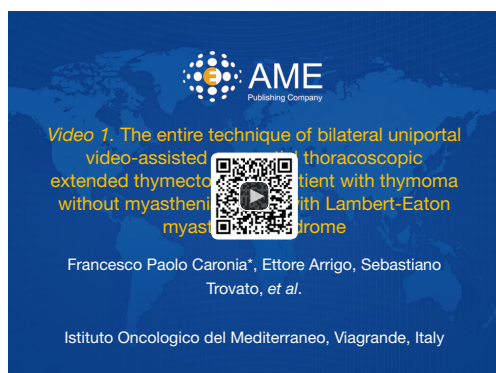
Figure 3 The entire technique of bilateral uniportal video-assisted sequential thoracoscopic extended thymectomy in a patient with thymoma without myasthenia gravis, with Lambert-Eaton myasthenic syndrome (22).

Available online: http://www.asvide.com/articles/1510