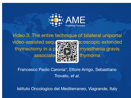
Figure 5 The entire technique of bilateral uniportal video-assisted sequential thoracoscopic extended thymectomy in a patient with myasthenia gravis associated to a little thymoma (24).

Available online: http://www.asvide.com/articles/1511