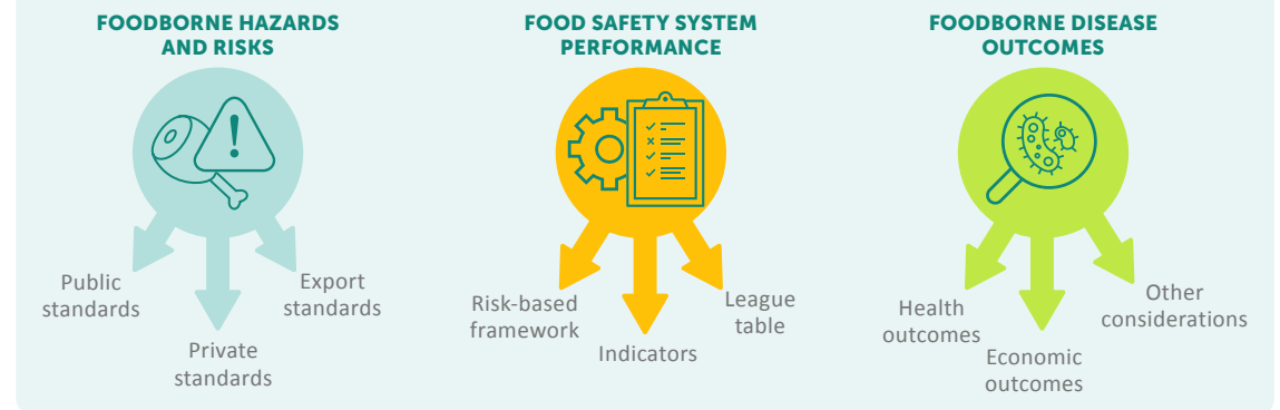
Figure 1. Food safety metrics conceptual framework.

In making suggestions and recommendations, we consider measures and metrics under three rubrics: