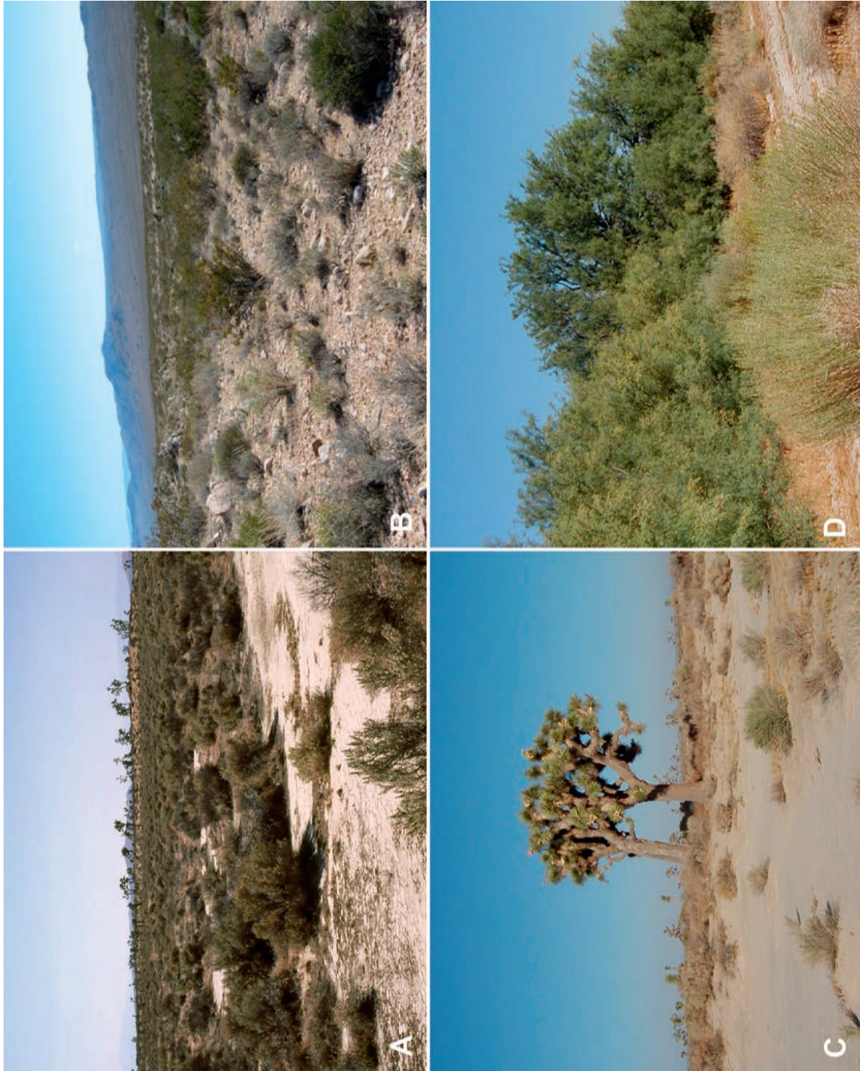
Fig. 3. Plant communities at Edwards Air Force Base, California.—A. Saltbush scrub.—B. Pan-dune mosaic near Buckhorn Dry Lake.—C. Open stand of Joshua tree woodland where sand has accumulated above the old lakebed.—D. Mesquite woodland.