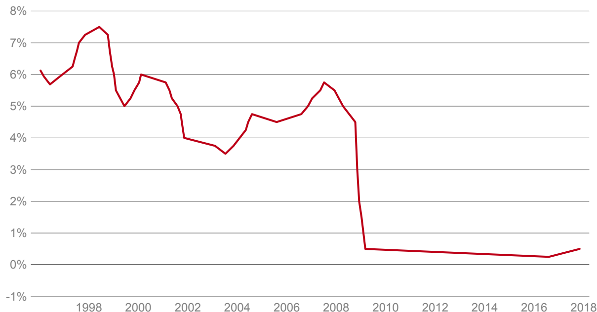
Chart: The Conversation • Source: Bank of England

In recent research that colleagues and I published in the Journal of Affective Disorders , we explored how Bank of England interest rate changes from 1995 to 2008 influenced people's mental health. What we found is that for each 1% increase in interest rates, there was a 2.6% increase in the incidence of mental health issues experienced by those heavily indebted.