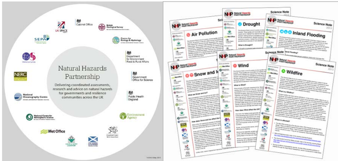
Figure 1 a) The NHP collaboration b) NHP Science Notes