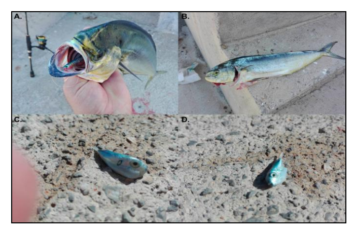
Fig 2: The specimen of C. hippurus caught (A, B) and the juvenile L. sceleratus (C, D) found in the oesophagus.

It has been demonstrated that non-toxic species show low resistance to TTX and TTX-bearing organisms use it effectively as a defensive or offensive substance [14]. According to the results of Katikou et al. (2009) [15], toxicity was not detected in any of the tested tissues of two L. sceleratus specimens smaller than 16 cm. However, the effect of L. sceleratus consumption on other species acting as predators has not been extensively studied and therefore, any assumption would be ambiguous.