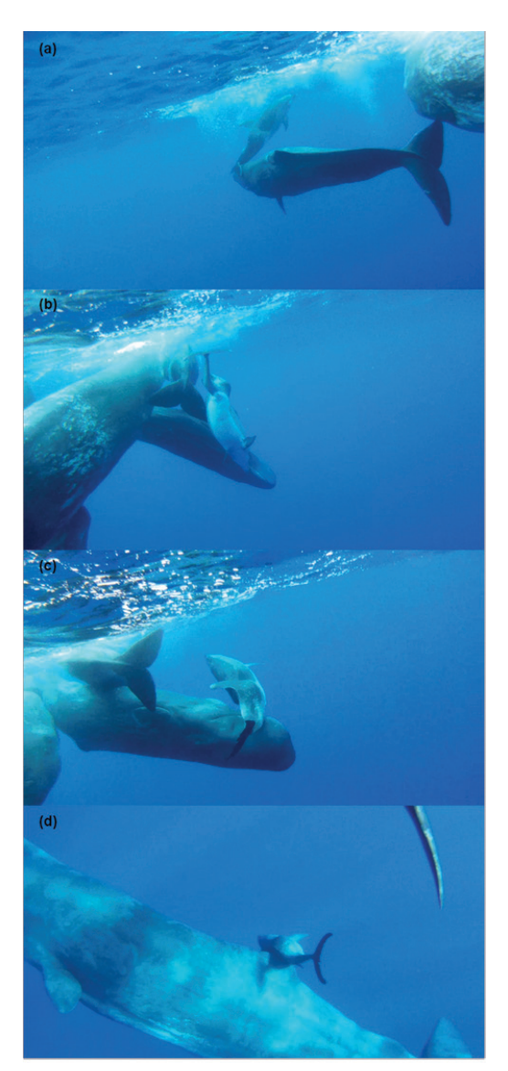
Figure 2. Four forms of physical contact initiated by a bottlenose dolphin while interacting with a group of sperm whales; enlarged photographs show the dolphin (a) touching its fluke to the head of a calf, (b) nuzzling a calf with its rostrum, (c) touching its pelvic region to the lower jaw of a subadult, and (d) initiating dorsal fin to dorsal fin contact.

Sperm whales appeared to treat the dolphin as a conspecific, at times both permitting and initiating physical contact (Figure 3a), and in a manner similar to that seen between other group members