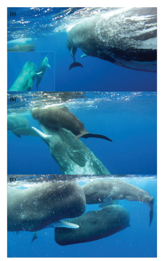
Figure 3. Enlarged photographs of a form of physical contact in which (a) a bottlenose dolphin as well as sperm whale (b) calves or (c) subadults would position themselves between or just in front of the open jaws of an adult female sperm whale; this behaviour was also noted to occur between the dolphin and a subadult female sperm whale (inset photo [a]).

were nearly ubiquitous during all observations, vocalisations from the dolphin were only noted occasionally when socializing. However, this would be expected as much of the dolphin vocal repertoire (i.e., broadband clicks) lies outside of the range of the recording equipment used during our observations and, as such, other forms of communication may have been ongoing in some or all of the observation periods that we could not detect.