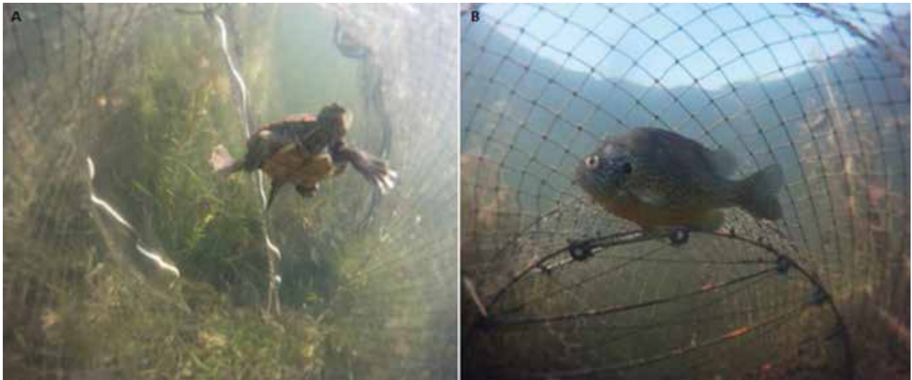
Figure 4. (A) Freshwater turtle and (B) sunfish documented in a commercial fishing net by an action camera device.

E. daemeli during early stages and were more efficient in determining presence/absence than conventional visual or trap surveys.