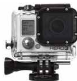
GoPro HERO 3

Due to their intended use in active recreational sports, the majority of AC products are “shockproof,” built to withstand drops from low-level heights or constant jarring. Similarly, many ACs possess integrated lithium-ion batteries and