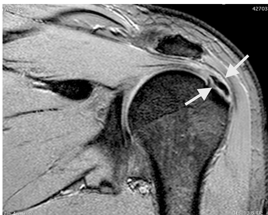
Fig. 2 Coronal fatty suppressed MRI reveals a focus of chronic calcification with associated full-thickness supraspinatus tendon tear (white arrows)