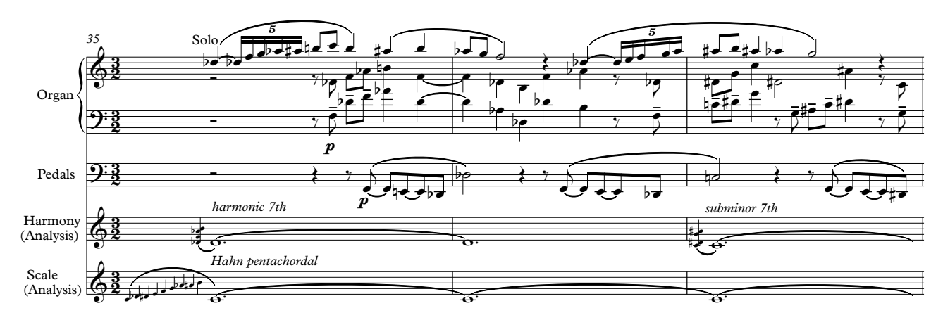
Figure 3: Excerpt from Torsten Anders, Tempziner Modulationen. The upper three staves show the actual composition and the lower two an analysis of the underlying harmony. Chord and scale tones are shown with small notes and root notes as normal notes.

Instead of memorising a large number of microtonal chords and scales with many transpositions, and then studying their relations, Anders modelled a suitable music theory in Strasheela (Anders and Miranda 2010a). This theory is based on ideas of conventional music theory, but with a twist: the resulting music is tonal in the sense of Tymoczko (2011), but it is decidedly non-diatonic.